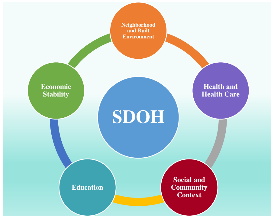
FIGURE 3: SOCIAL DETERMINANTS OF HEALTH (SDOH)