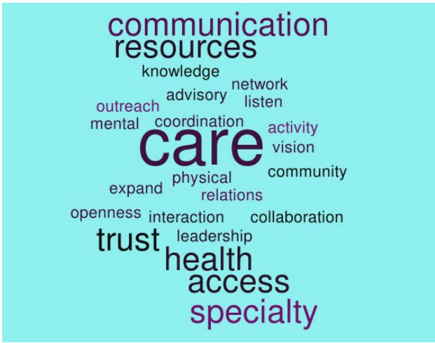
FIGURE 5: VISIONING WORD CLOUD, BRADFORD COUNTY, 2020

Source: Bradford County visioning exercise results, June 11, 2020, prepared using WordItOut by Enideo by WellFlorida Council, 2020