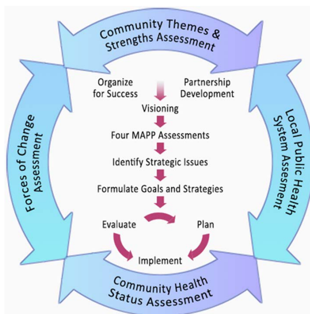
FIGURE 2: MOBILIZING FOR PLANNING THROUGH PLANNING AND PARTNERSHIPS (MAPP)